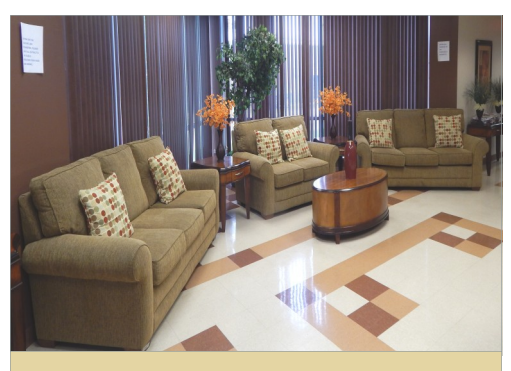
Resident Community Room