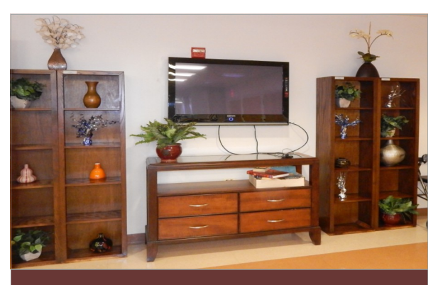
Resident Recreational Room

Close to pharmacies, supermarkets, Chicago Heights Public Library, public transportation, Lincoln Mall, and more..